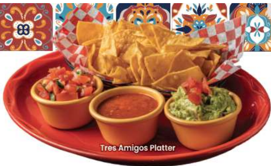
Tres Amigos Platter