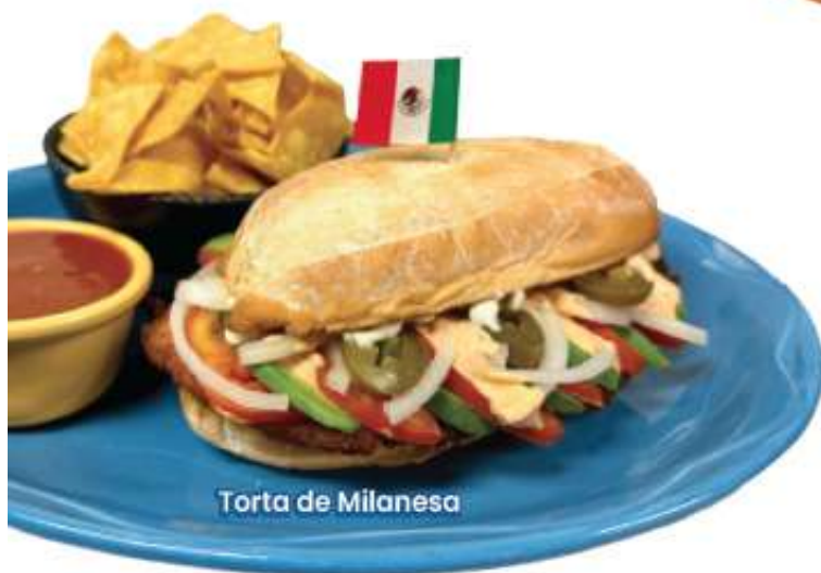
Torta de Milanesa