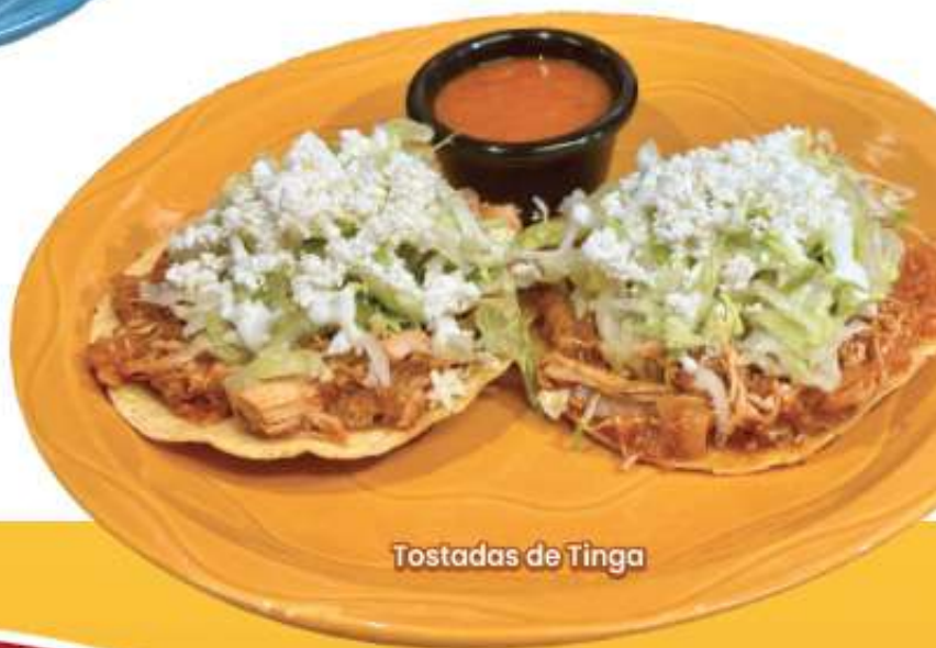
Tostadas de Tinga

Chipotle shredded chicken in a mild chipotle sauce served on two crispy corn tortillas, topped with lettuce, cheese, sour cream and your choice of salsa.